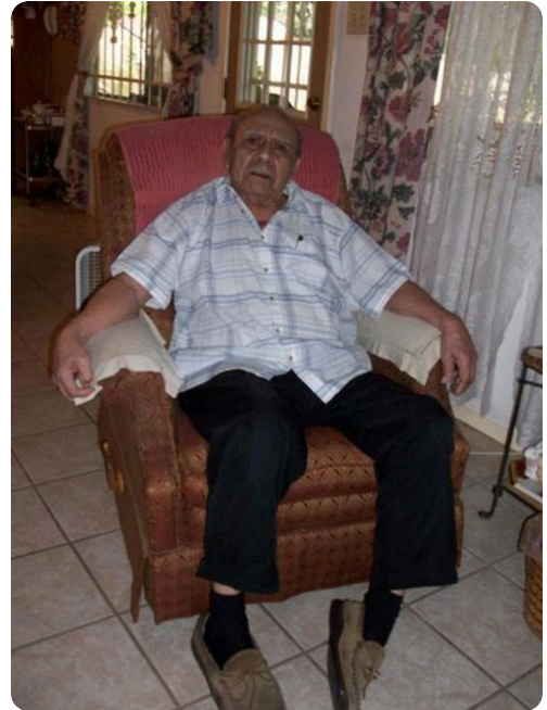
visiting my uncle Dec 2010